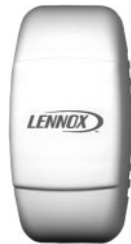
Remote Outdoor Sensor Furnished