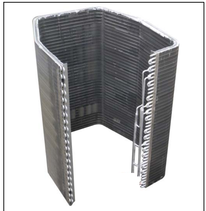
FIGURE 1. Aluminum Replacement Coil

Verify that the liquid and discharge manifold position matches that of the existing coil before removing original coil. Take care not to damage the liquid line stub.