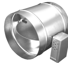
ROUND ZONE DAMPER