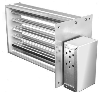
RECTANGULAR ZONE DAMPER