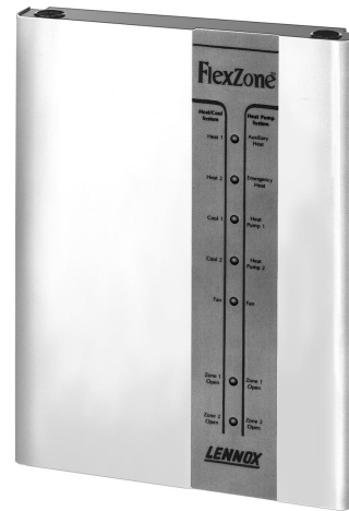
FLEXZONE CONTROL PANEL

Transformer (Required) — 24 volt transformer is not furnished and must be ordered extra.