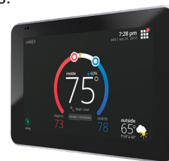
iComfort® E30 Smart Wi-Fi Thermostat