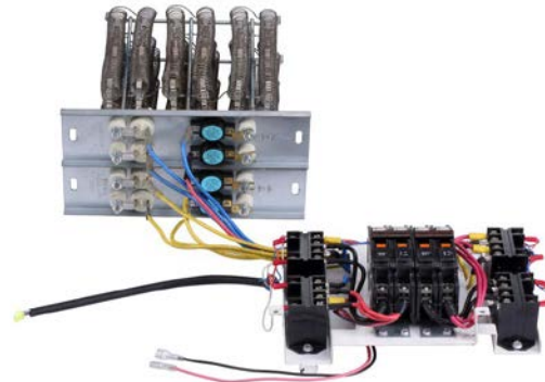
V8EH0150P-1, V8EH0200P-1 Electric Heat Kits